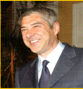
The current President-in-Office, José Sócrates , Prime Minister of Portugal.